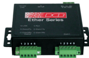
Front view of Isolated Version