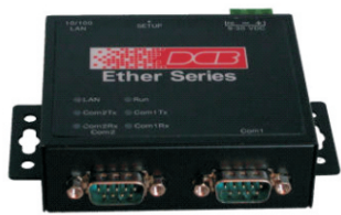
Front view RS-232/422/485 Connector