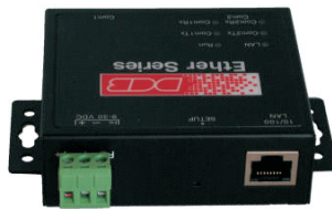
Rear view LAN Connectors